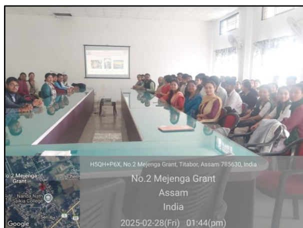
National Science Day Celebration 28.02.2025