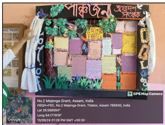
Departmental Wall Magazine “Panchajanya”