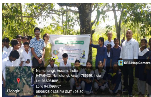
World Environment Day 2025 at Pragati ME School Namchungi