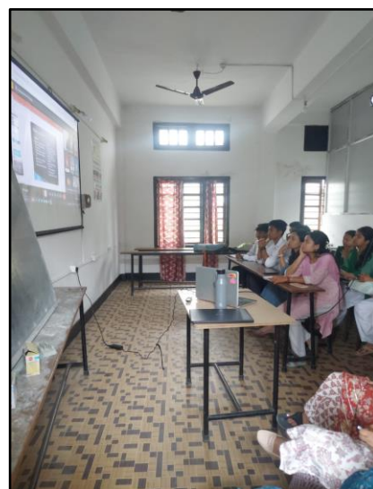
Popular talk on "An insight into IFS Examination pattern & preparation"