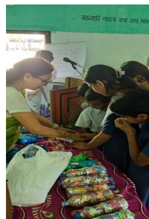
Extension Activity on Beating Plastic Pollution at Pragati ME School, Namchungi on 05.06.2025