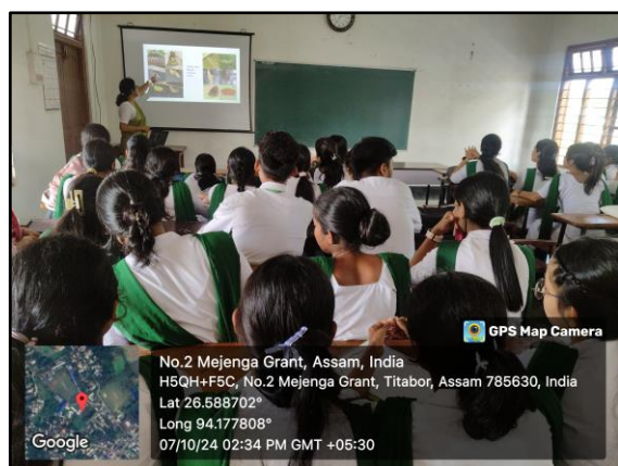
National Wildlife Week 2024