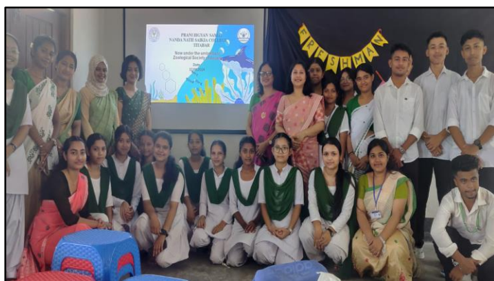
Departmental Freshmen Social