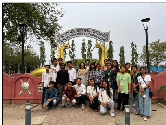
Field Visit to CMERTI Ladoigarh