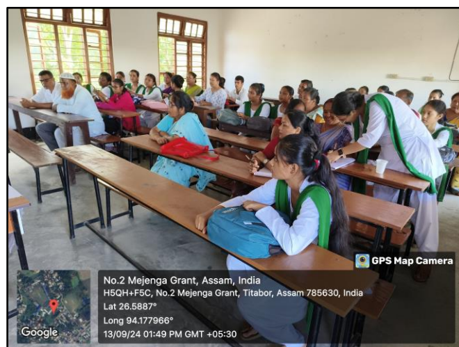
Parents-Teachers Meet 13.09.2024