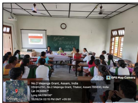
Parents-Teachers Meet 13.09.2024