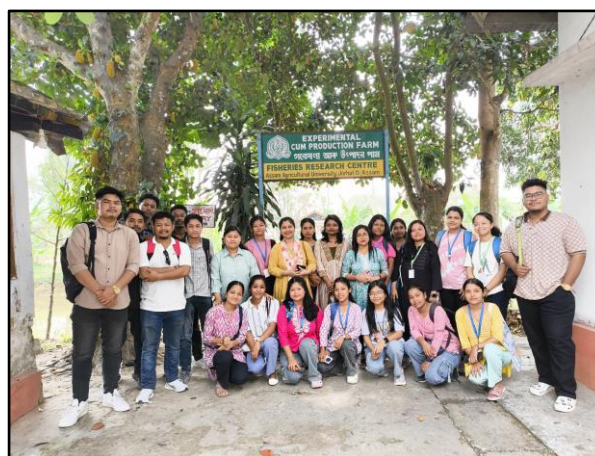
6 th Semester Students' Field Visit to FRC, AAU 07.04.2025