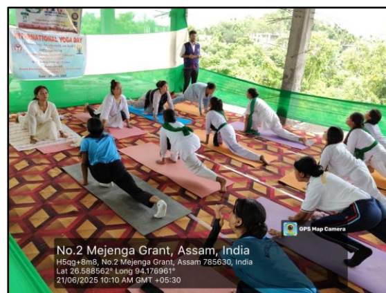
International Yoga Day 2025