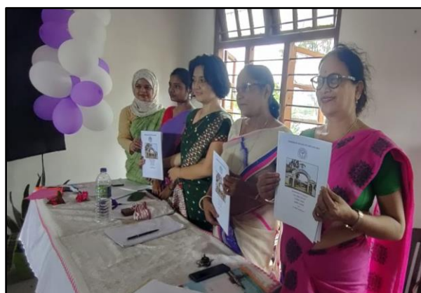
Departmental Bulletin Inauguration