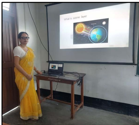
World Ozone Day 16.09.2024