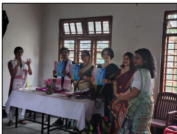
Inauguration of “Pakhi”