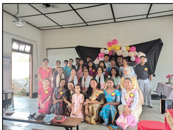
Farewell 2022-25 Batch