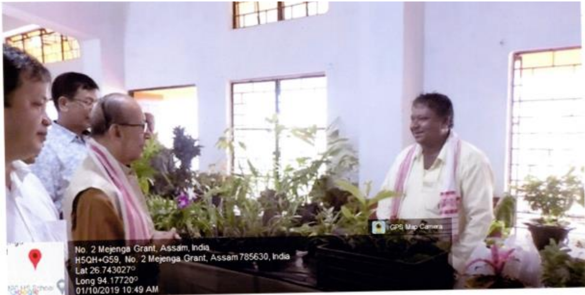
Exhibition-cum-Trade Fair: Photo 6