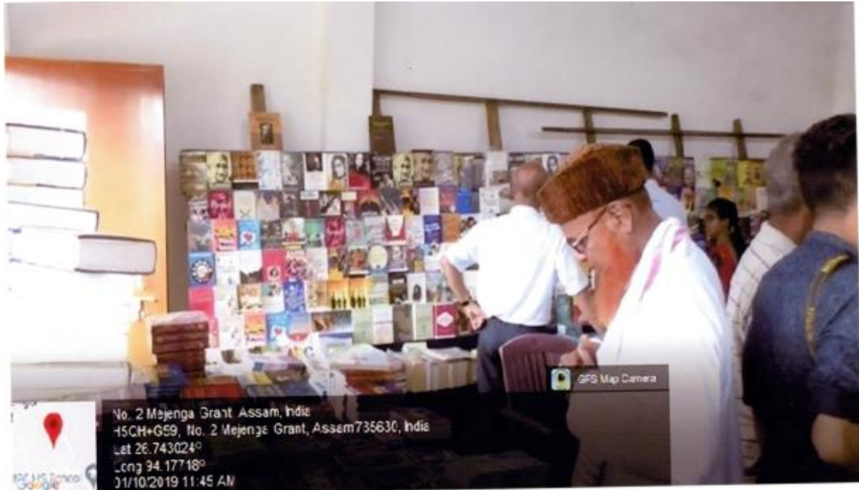
Book Fair: Photo 2