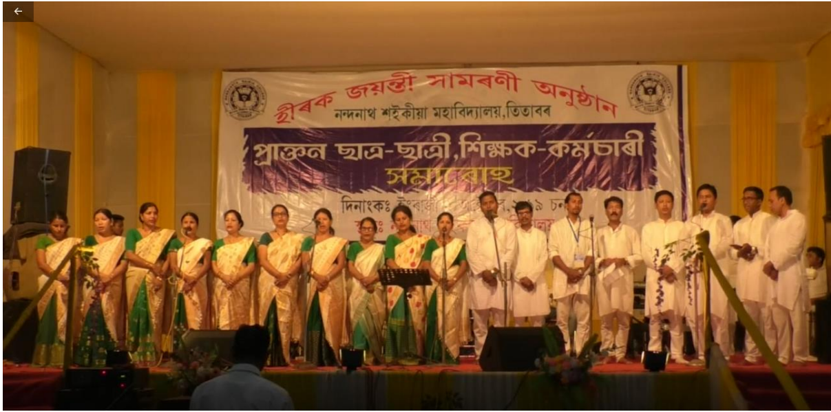
Alumni Meet: Photo 2