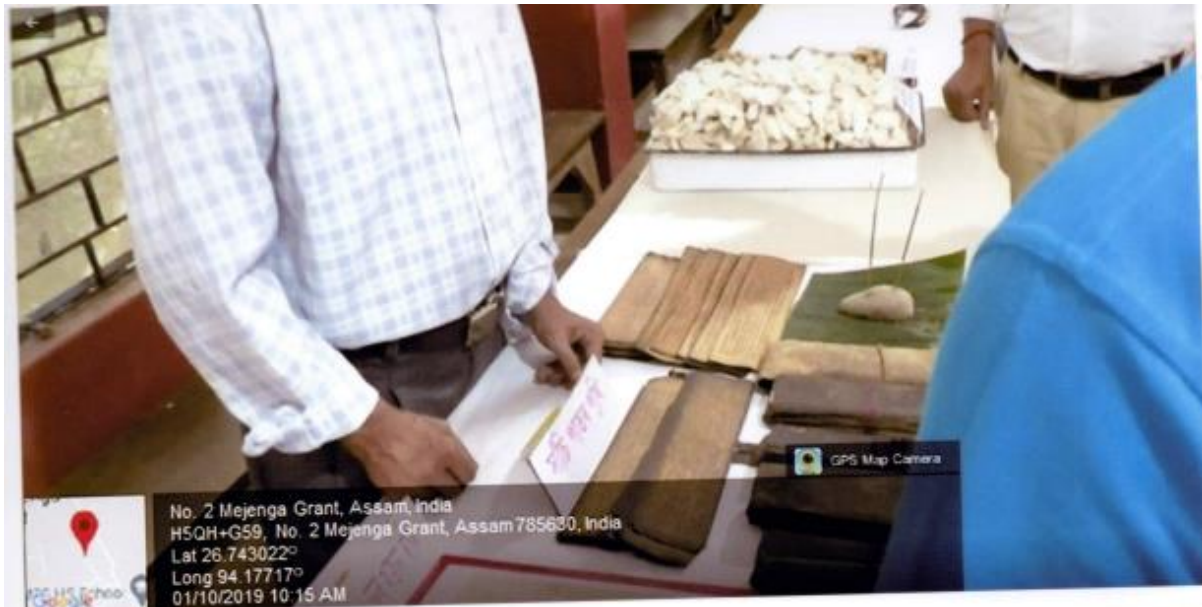
Exhibition-cum-Trade Fair: Photo 2

No. 2 Mejenga Grant, Assam, India H5QH+G59, No. 2 Mejenga Grant, Assam 785630, India Lat 26.743022° Long 94.17717° 01/10/2019 10:15 AM