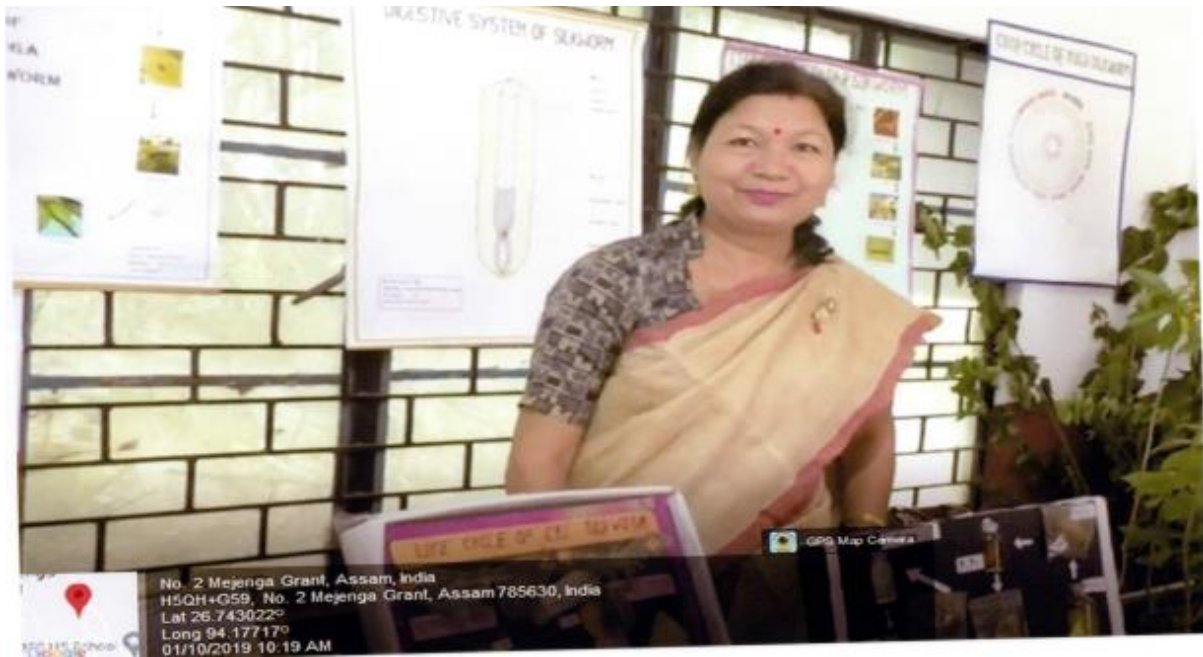
Exhibition-cum-Trade Fair: Photo 4