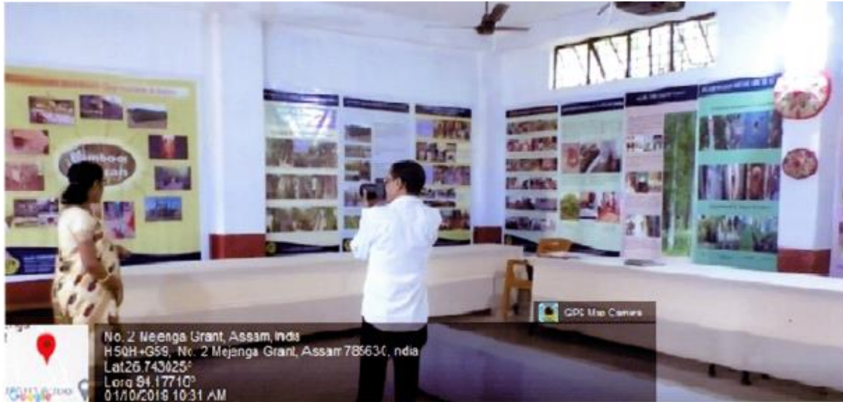
Exhibition-cum-Trade Fair: Photo 1

No. 2 Mejenga Grant, Assam, India H5QH+G59, No. 2 Mejenga Grant, Assam 785630, India Lat 26.743025° Long 94.17717° 01/10/2019 10:31 AM