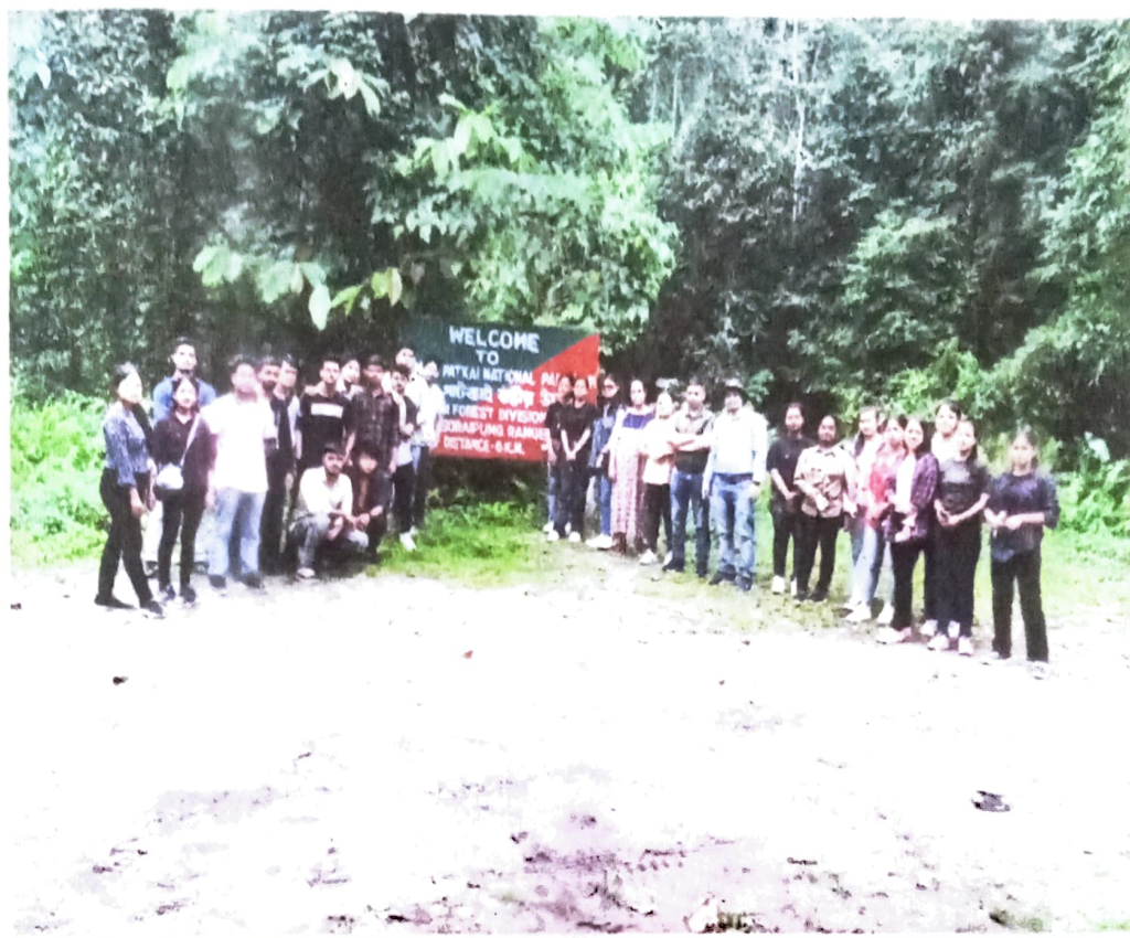
Group photo in Dehing patkai national park,